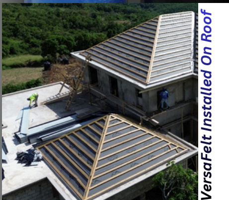
VersaFelt Installed On Roof